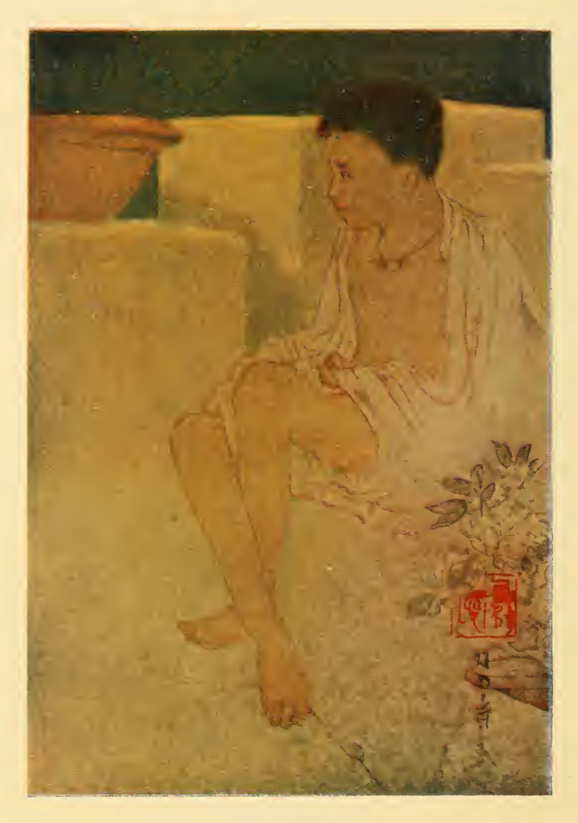
FAIRVLAND. From a drawing by Abanindranath Tagore.